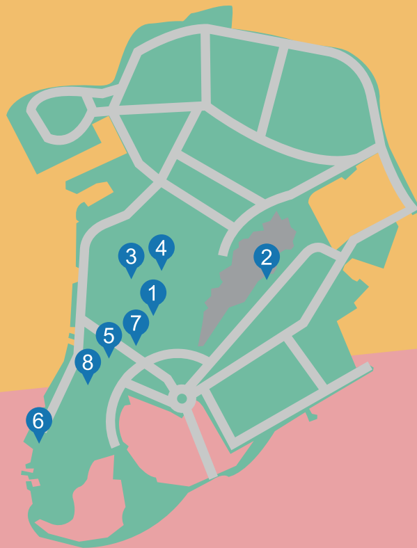
聖母聖誕主教座堂 Catedral Igreja da Sé